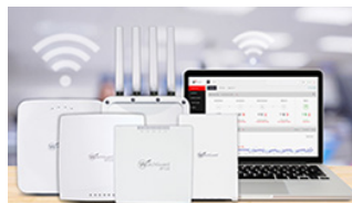
Secure Cloud Wi-Fi