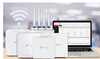
Secure Cloud Wi-Fi